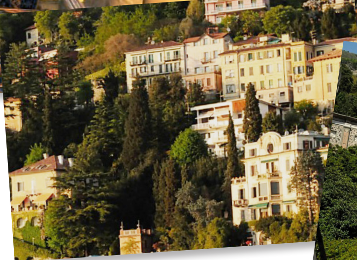
View of Lakeside Town