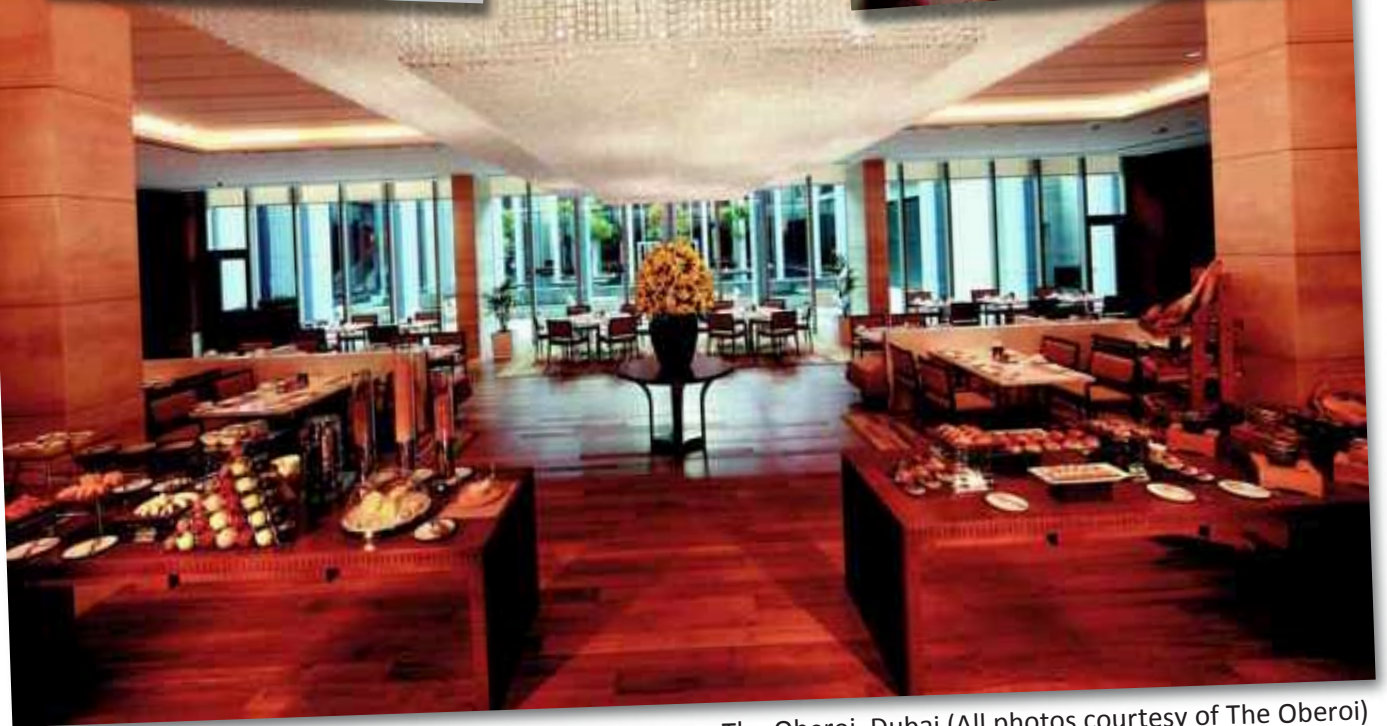
The Oberoi, Dubai