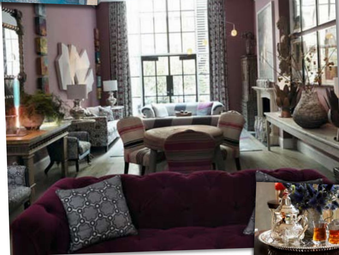
Crosby Street Hotel