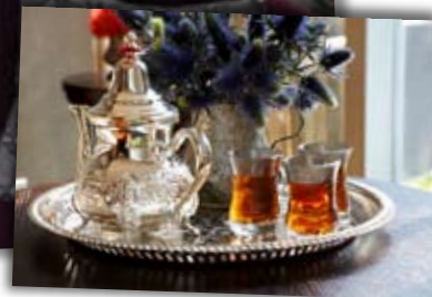
Trump SoHo Spa